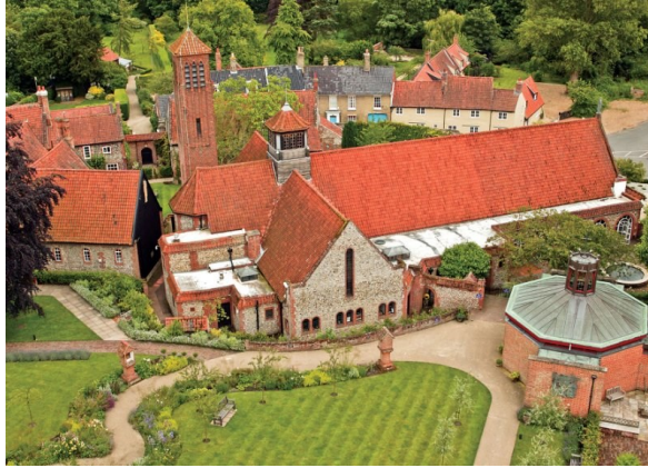
The Shrine Church at Walsingham, England