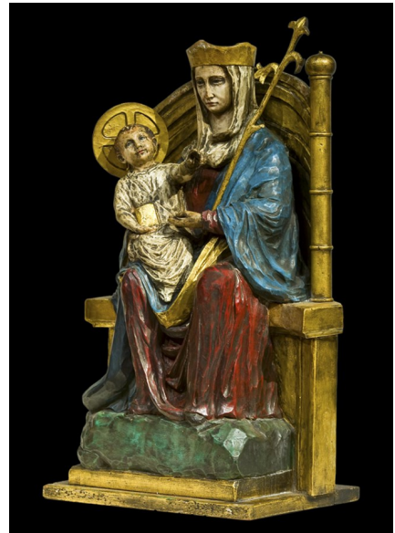
From right to left: Lady Walsingham at Shrine in England and at All Saints' Episcopal Church in San Diego, CA