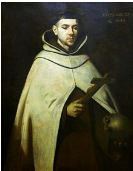
Painting by Francisco de Zurbarian, 1656

Juan de Ypres y Alvarez was born in 1542. His father died soon after, and Juan was brought up in an orphanage. (His father was probably Jewish. It is remarkable how many of the most memorable Spanish Christians have been of Jewish background.) At seventeen, he enrolled as a student in a Jesuit college, and at twenty-one, he joined the Carmelite Friars. He was ordained in 1567, and almost immediately met Teresa of Avila, a Carmelite Nun who was undertaking to return the Order to its original strict rule, which had been gradually relaxed to the detriment, as she believed, of the spiritual lives of the members of the Order. Those who followed the strict rule as promulgated by Teresa went barefoot or wore sandals instead of shoes, and so became known as Discalced (unshod) Carmelites, or Carmelites of the Strict Observance. John undertook to adopt the stricter rule and encourage others to do so.