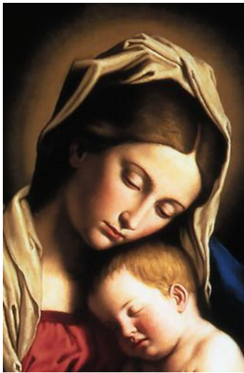
ON THE COVER: Oil painting—Madonna, The Virgin Mary with sleeping baby Jesus.