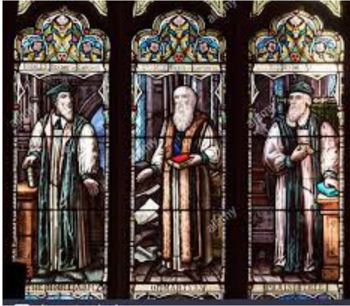
Ridley, Crammer and Latimer—Stained glass window at St. Mary's Church, Melton Mowbray, Leicestershire, England

Hugh Latimer, Bishop and Martyr 16 October 1555